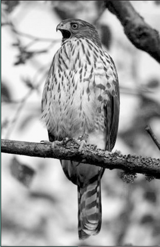
An alert juvenile male Cooper's Hawk