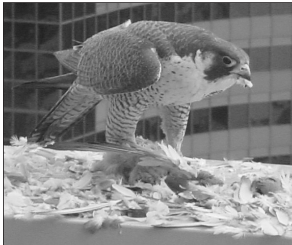
Seattle Peregrine Bell, finishing a meal

Predator-prey relationships ( or interactions ) are a complex and fascinating part of the web of life. Studies of these interactions are ongoing, and the results are sometimes equivocal, as scientists try to figure out not only what happens but why it happens. If you are fortunate enough to observe a raptor hunting, try to note how it hunts, the habitat where it hunts, what it is trying to catch, and what its intended prey does to try to avoid being a meal. Rather than seeing this as killer versus victim, look at it as a natural process that’s part of the much larger picture of how an ecosystem works. Observing this and then asking questions can open a window into a complex world.