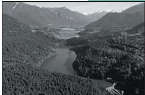
Elwha Dam, lower right

This would not be taking place were it not for the tenacious and enduring struggle by Seattle Audubon and all the other groups that have shown such dedication to restoring this gem of the Olympics.