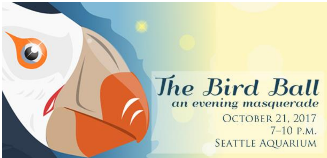
612x295 banner for Facebook